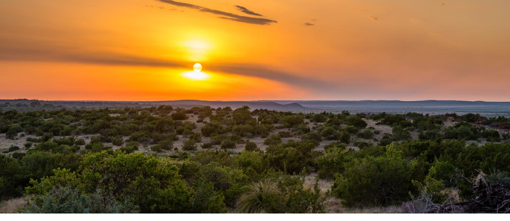
Texas Specially Hunts